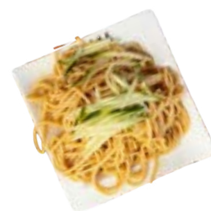
10. Cold Noodles with Peanut Butter Nouilles froides au beurre d'arachide