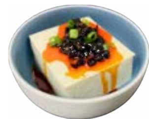
6. Spicy Tofu Tofu épicé