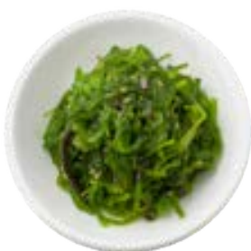
9. Marinated Seaweed Salad Salade d'algues marinées