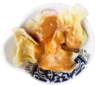
7. Peanut Butter Dumplings (Pork) Dumplings au beurre d'arachide (Porc)