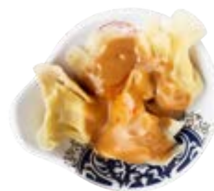
8. Peanut Butter Dumplings (Shrimp) Dumplings au beurre d'arachide (Crevette)