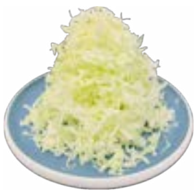
4. Coleslaw Salade de chou