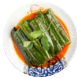
5. Hot and Sour Cucumber Concombre aigre-piquant