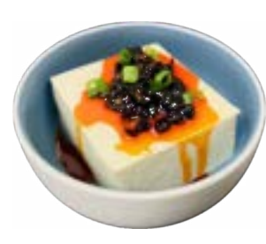
6. Spicy Tofu Tofu épicé