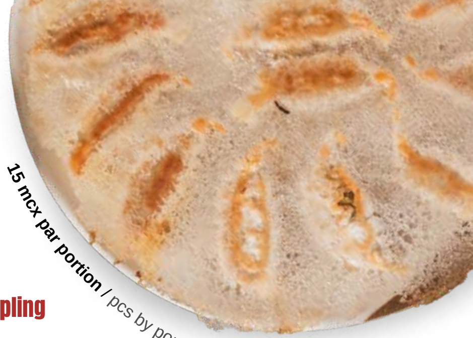
15 mcx par portion / pcs by portion