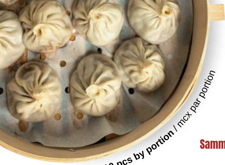
10 pcs by portion / mcx par portion