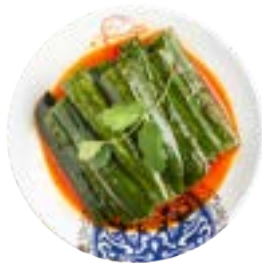
5. Hot and Sour Cucumber Concombre aigre-piquant